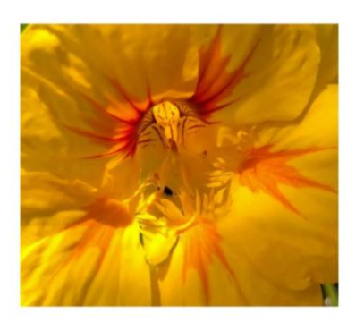
'Considering the beauty in creation is healing'