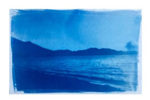
'Healing is on the horizon'

This year's theme for refugee week was 'Healing' and we facilitated an online space for people to submit their images and art works around the theme. See below for some of the wonderful images and reflections on healing that were submitted and showcased on our social media platforms.